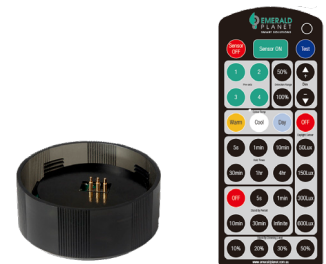
Sensor and Sensor Remote Control sold separately

The optional plug and play motion and daylight sensor offers additional energy-savings, is easily installed (no wiring required) and conveniently controlled from the ground via a remote control.